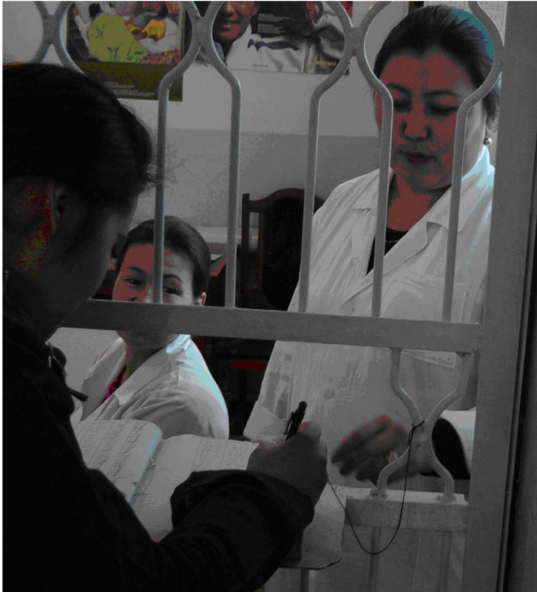
Photo: Methadone Maintenance Programme in Osh